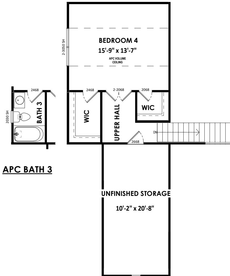
APC BATH 3